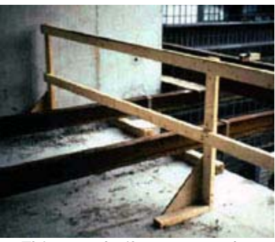
This guardrail appears to be properly constructed except for the missing toeboard that is required to prevent object from falling to the floor below and possibly striking another worker.